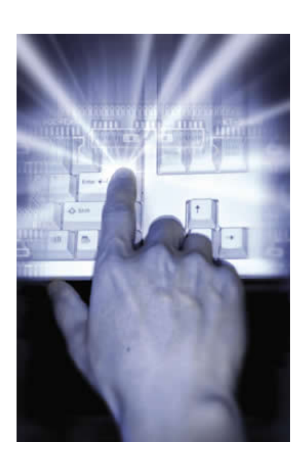
A Quick Review of Al